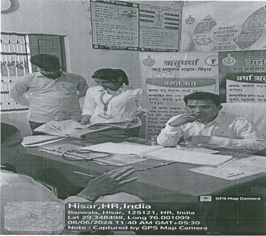
Hisar, HR, India Barwala, Hisar, 125121, HR, India Lat 29.348498, Long 76.001099 08/06/2024 11:40 AM GMT+05:30 Note : Captured by GPS Map Camera