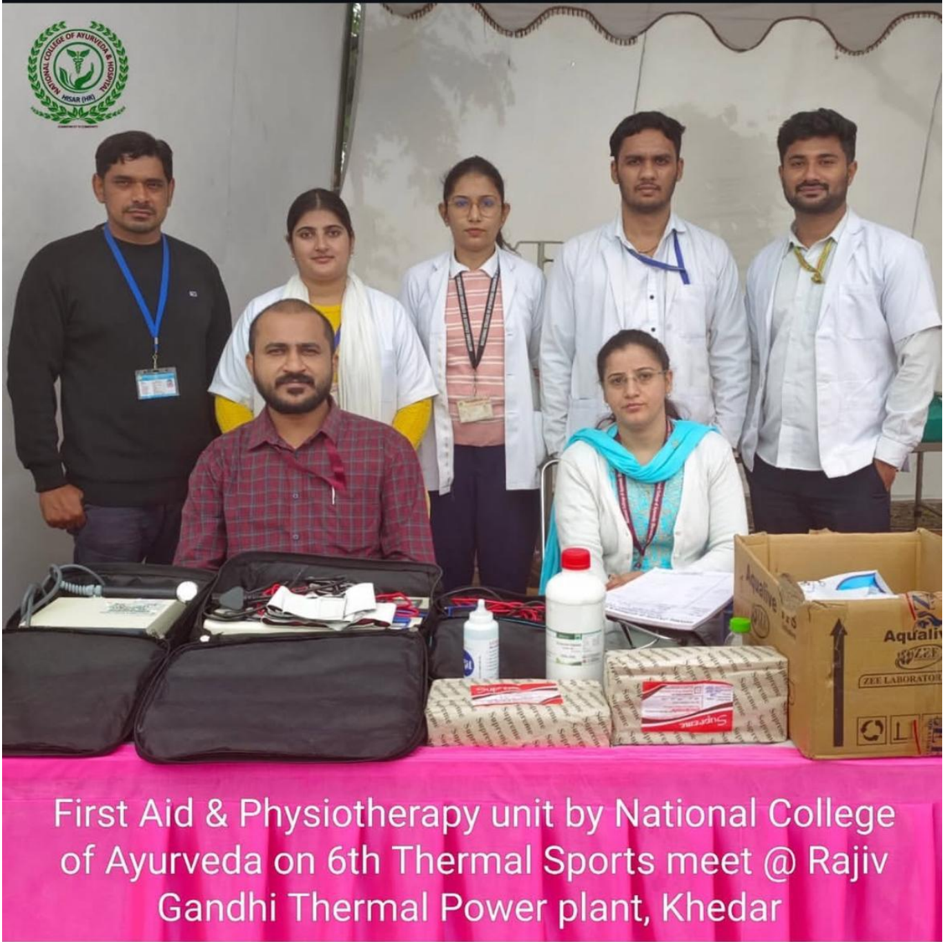
First Aid & Physiotherapy unit by National College of Ayurveda on 6th Thermal Sports meet @ Rajiv Gandhi Thermal Power plant, Khedar

* Camp photos are attached below / next page