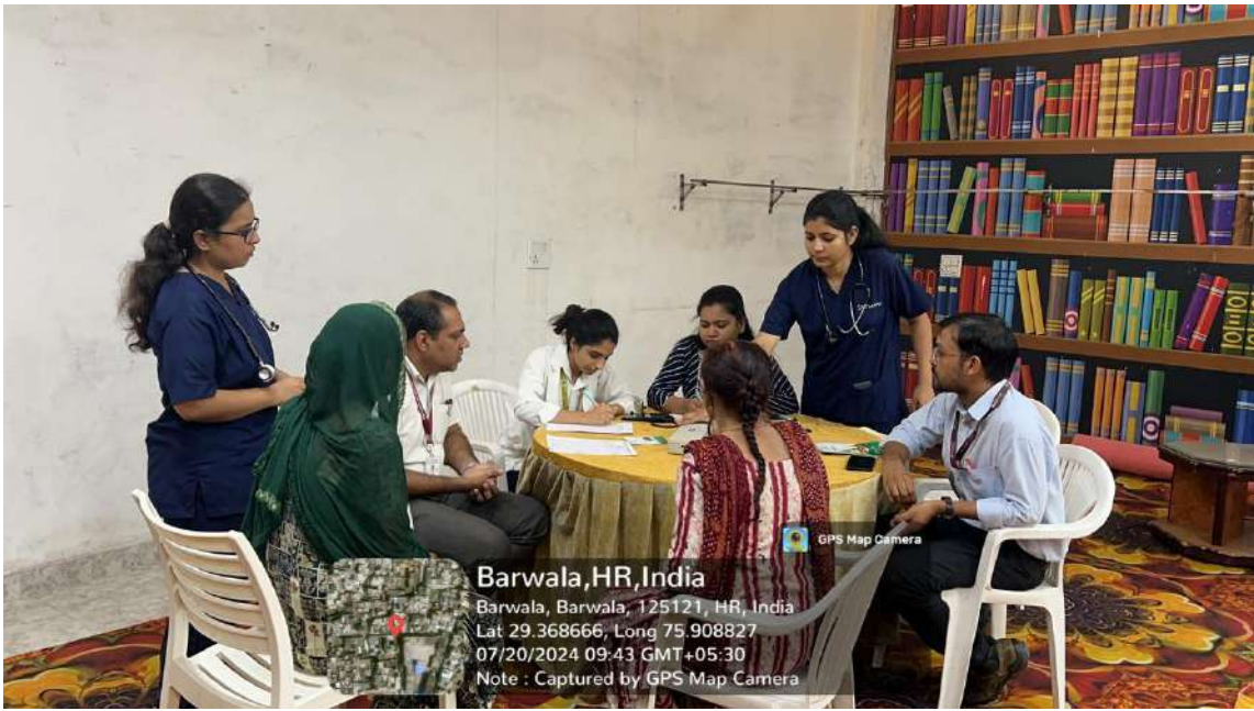
Barwala,HR,India Barwala, Barwala, 125121, HR, India Lat 29.368666, Long 75.908827 07/20/2024 09:43 GMT+05:30 Note : Captured by GPS Map Camera