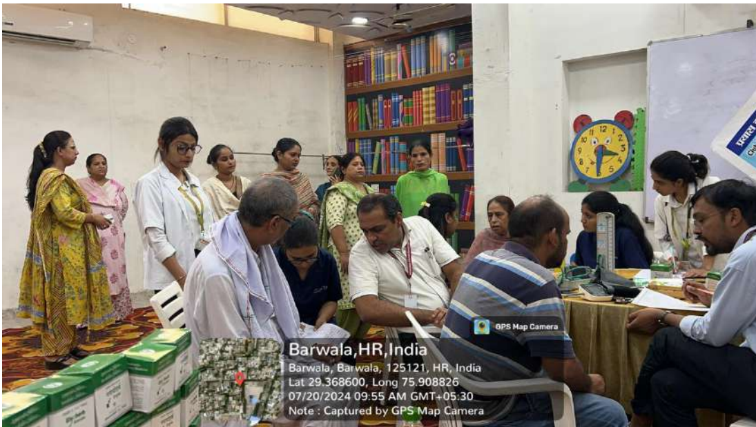
Barwala,HR,India Barwala, Barwala, 125121, HR, India Lat 29.368600, Long 75.908826 07/20/2024 09:55 AM GMT+05:30 Note : Captured by GPS Map Camera