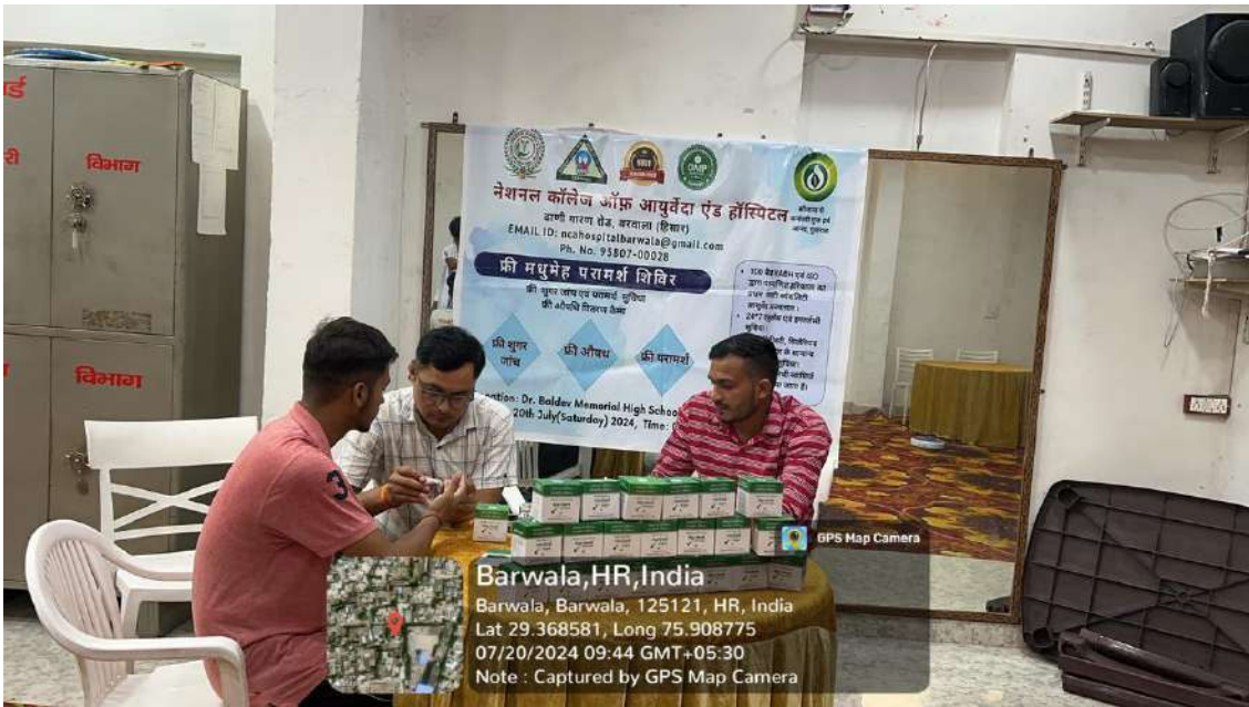
Barwala,HR,India Barwala, Barwala, 125121, HR, India Lat 29.368581, Long 75.908775 07/20/2024 09:44 GMT+05:30 Note : Captured by GPS Map Camera